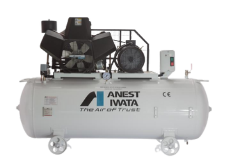
Oil Free Reciprocating Air Compressor