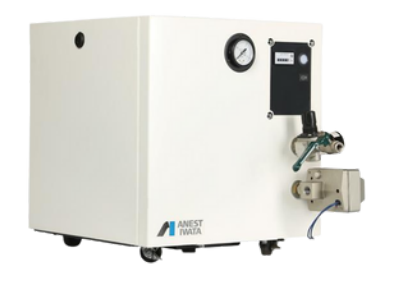
Oil Free Wobble Air Compressor