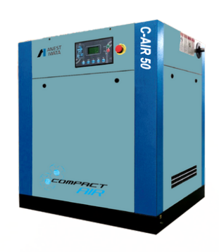
Rotary Screw Air Compressor