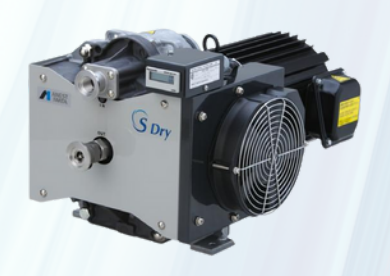
Dry Scroll Vacuum Pump