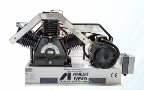
Reciprocating Vacuum Pump