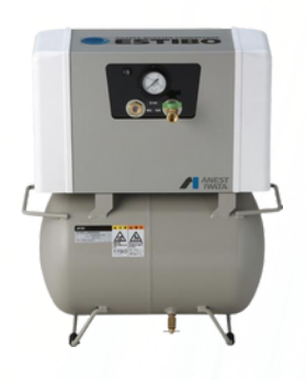
Booster Air Compressor