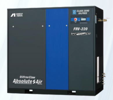
Oil Free Claw Air Compressor