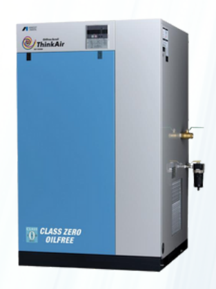
Oil Free Scroll Air Compressor