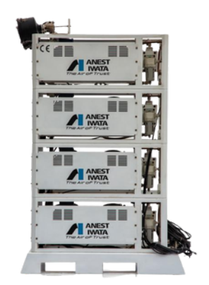
Medical Air plant