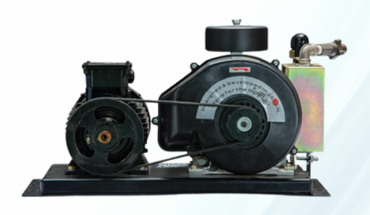
E-Bus Air Compressor