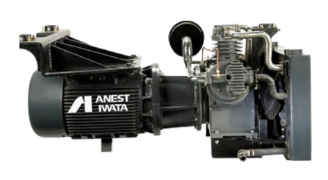
Railway Braking Compressor