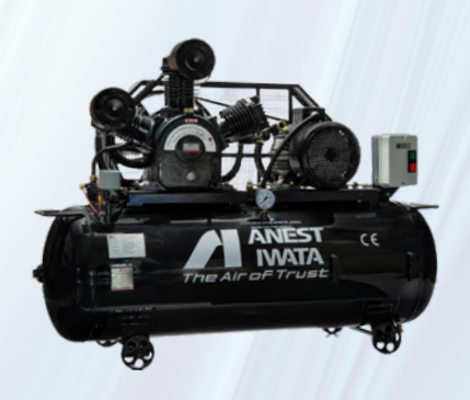
Reciprocating High Pressure Air Compressor