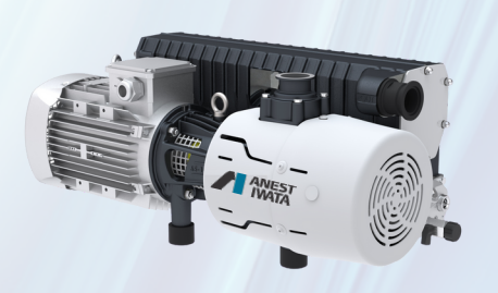
Rotary Vane Vacuum Pump