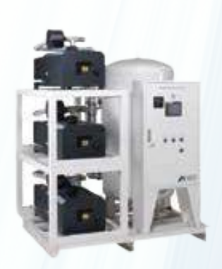
Medical Vacuum plant